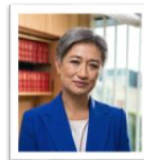
Senator the Hon. Penny Wong Minister for Foreign Affairs 27th November 2025

How the world addresses HIV/AIDS. This has always been a collective effort and a collective responsibility.”