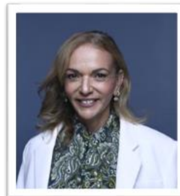
The Hon Dr Anne Aly MP Minister for International Development 11th November 2025

They have a catalytic impact for entire societies and indeed for countries.”