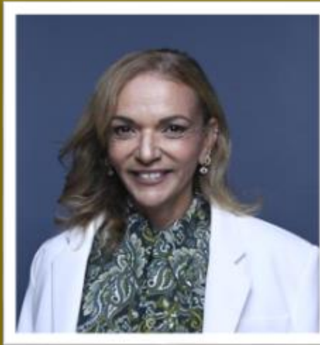
Senator the Hon Penny Wong Minister for Foreign Affairs 20 August 2024

At a time of global instability and uncertainty, Australia is a steadfast and reliable partner.