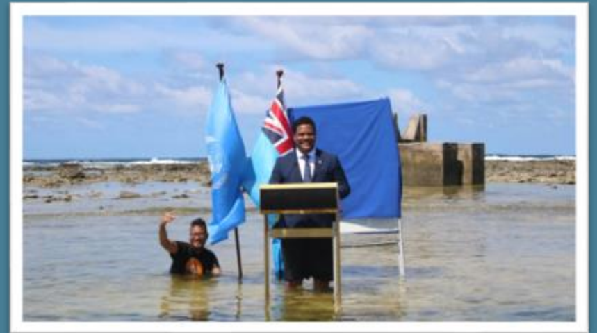
Tuvalu Minister gives COP26 address.

Fund a COP31 Civil Society Engagement Package ($10m)