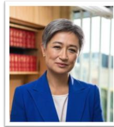
Senator the Hon. Penny Wong Minister for Foreign Affairs 16th October 2024

“Right now, there is more conflict than any time since the Second World War and the worsening impacts of climate change mean Australia’s humanitarian action must be fit for our times and the future. ”