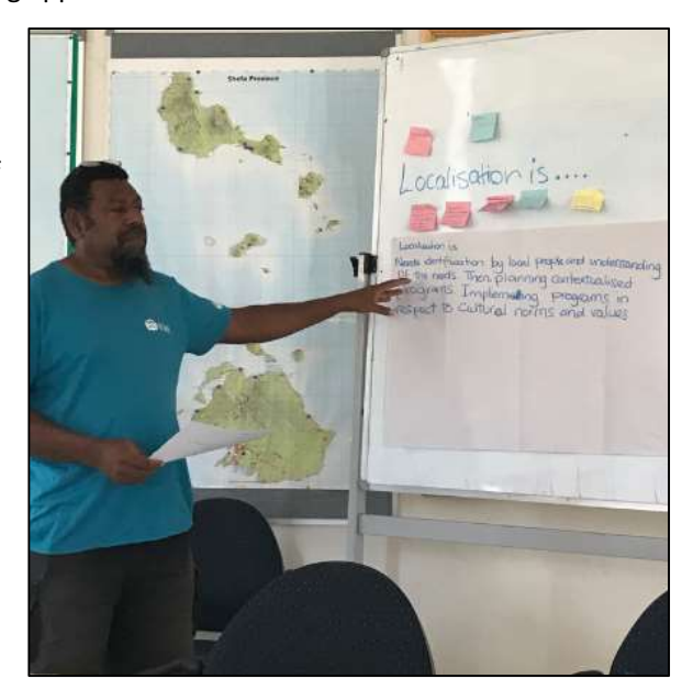
Developing a definition of localisation. Emergency Response