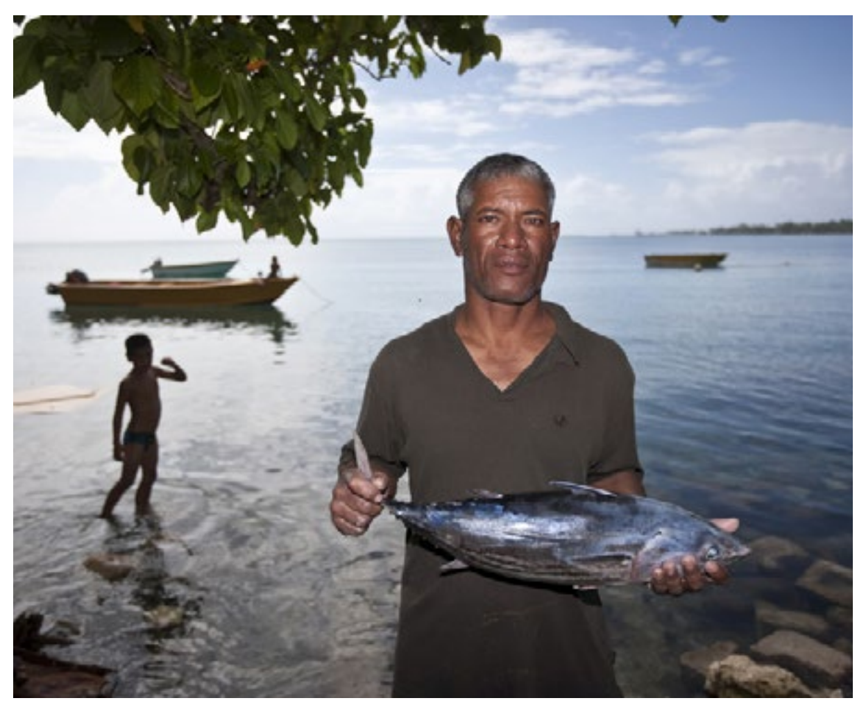
Bringing the fish catch ashore in Tuvalu .

Climate change could stall and reverse progress in women's empowerment and gender equality. Women are disproportionately affected by climate change, given that they make up the majority of the world's poor, have unequal access to rights and resources, and are more vulnerable in their roles as food producers, providers and care givers.<sup>15</sup> Women-headed households are more likely to be situated in insecure areas, such as floodplains, than male-headed households. Furthermore, gender inequality is exacerbated in periods of disaster and disaster response.