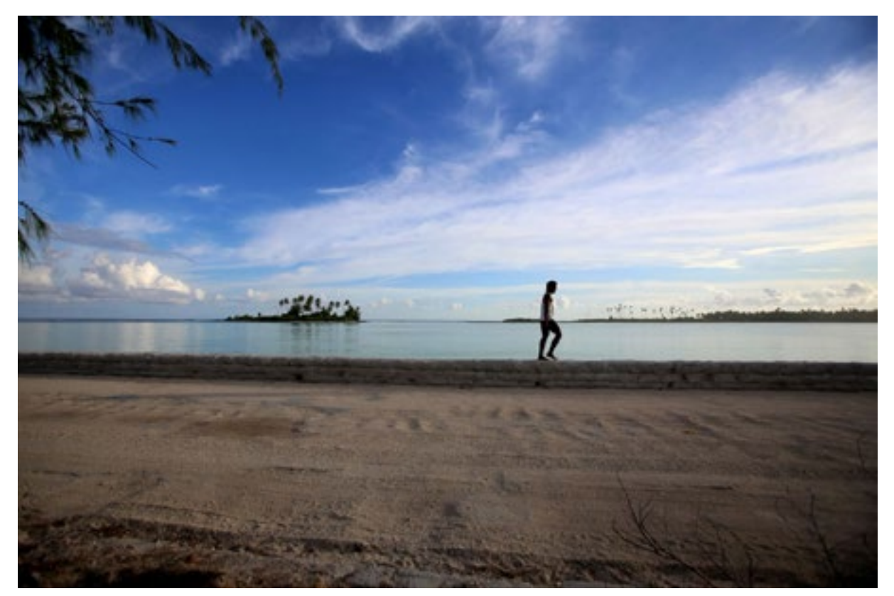
Rising sea levels threaten to inundate islands in the Pacific.

Australia also has an important role to play to ensure that the SDGs, once agreed, are implemented and adequately financed, both through our aid program and at home. Unlike previous development goals, the SDGs apply equally to all signatory countries, developed and developing countries alike. As a prosperous and respected nation, Australia must lead by example by implementing the SDGs domestically while also assisting other nations to do the same.