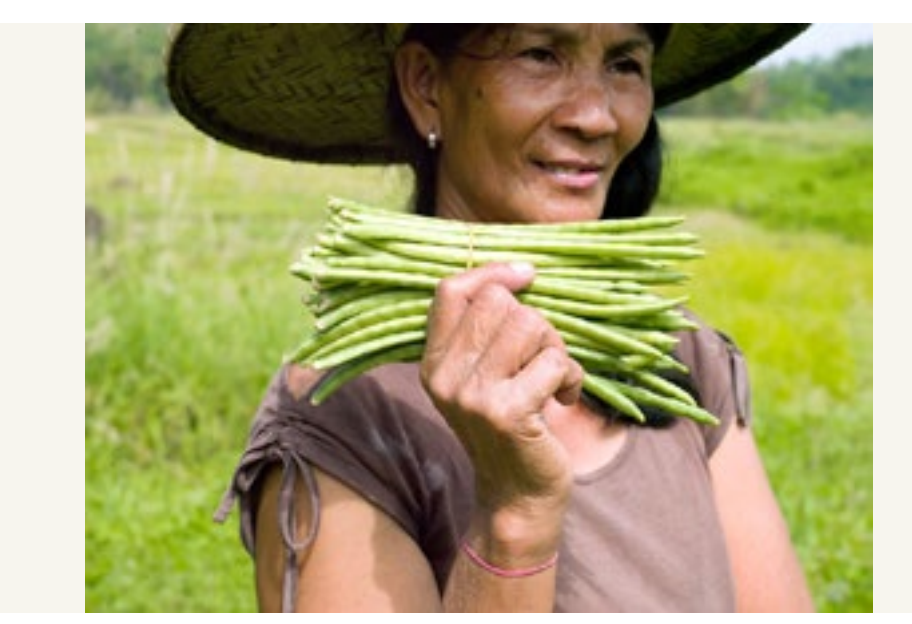
Agricultural climate change adaption project in Mindanao, Philippines.

Economic growth in developing countries is significantly undermined by climate change as critical industries such as tourism, agriculture and fisheries are affected by extreme weather events, slow-onset changes in temperature and rainfall patterns, and ocean acidification.<sup>11</sup> Industries in the Pacific are highly vulnerable: the Asian Development Bank estimates the effect of climate change on crop productivity, fisheries, tourism revenue, and human health in the Pacific could cost countries between 2.2% and 3.5% of GDP by 2050.<sup>12</sup>