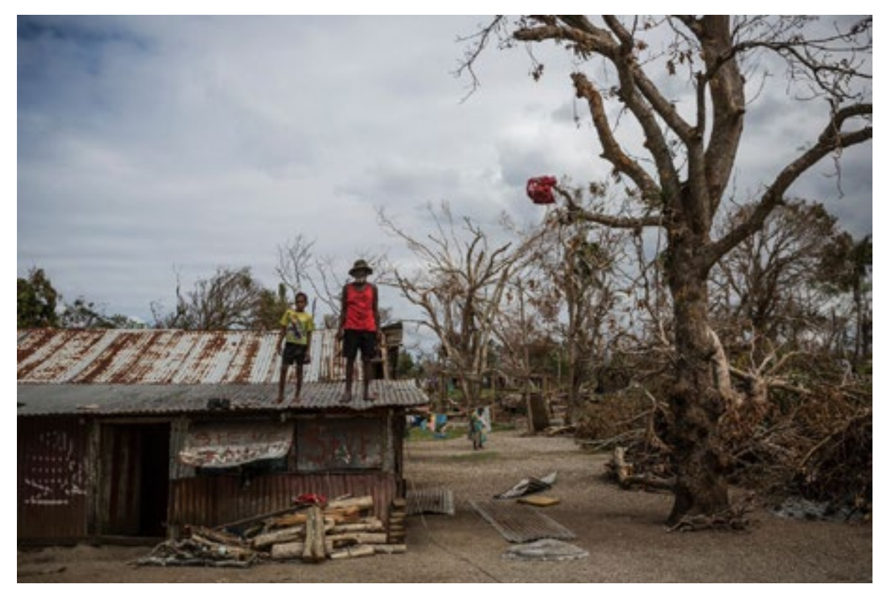
Devastation caused by Cyclone Pam in Vanuatu .

The Australian aid program previously placed a focus on supporting community-based climate change action, recognising the value of such action as a complementary component of government efforts to reduce the negative impacts of climate change, particularly in the Pacific. There is an opportunity to build on the successes of previous programs, re-investing in support for communities to develop local solutions to adapt and prepare for the impacts of climate change. By working directly with communities and using local knowledge, activities can be targeted to address community priorities and build the capacity of people to respond to climate change challenges and development needs.