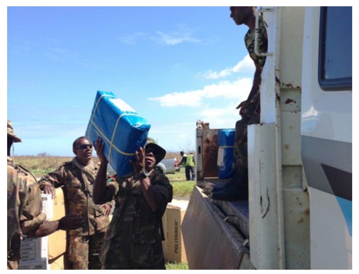
Supplies arrive following Cyclone Pam in Vanuatu .

The provision of climate finance to developing countries is central to combatting climate change, building resilience and promoting sustainable development. Many developing countries will need help to reduce their emissions and grow their economies in less emission-intensive ways. Access to finance, alongside technology cooperation and capacity building, is an opportunity to explore new avenues for both mitigation and adaptation action and to help poorer countries onto a cleaner development path so that they too can contribute to the global emissions reduction task.<sup>27</sup> Climate finance should pursue a gender-responsive and country driven