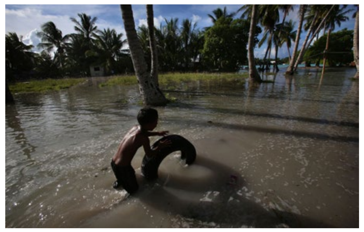
A child plays in a king tide flood in Kiribati.

The stated purpose of Australia's aid program is to promote Australia's national interests by contributing to sustainable economic growth and poverty reduction, focused on the Indo Pacific region.<sup>30</sup> ACFID emphasises that this purpose can only be achieved through concerted action on climate change. This is vital to protect development gains made in the region, to ensure the ongoing stability of fledgling nations, and to help countries on a path to sustainable development. Without concerted action on climate change, the need for aid and humanitarian response in Australia's region is likely to grow rapidly over time. Preventative action today can reduce the need for much larger amounts of aid in the longer term.