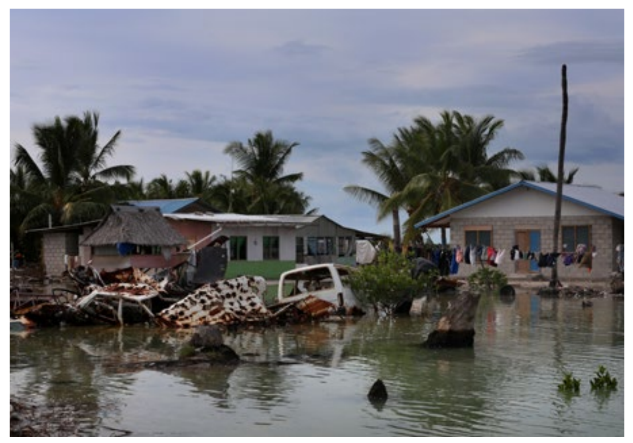
Flooding in Kiribati following a king tide.