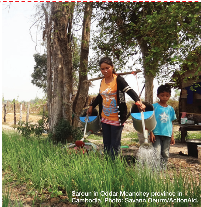
Saroun in Oddar Meanchey province in Cambodia.