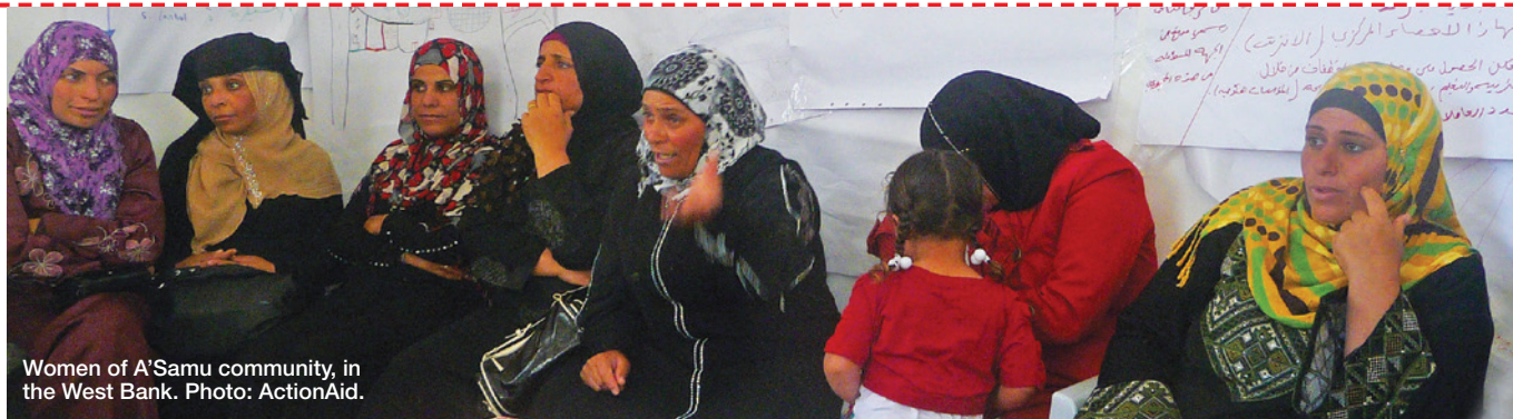
Women of A'Samu community, in the West Bank.