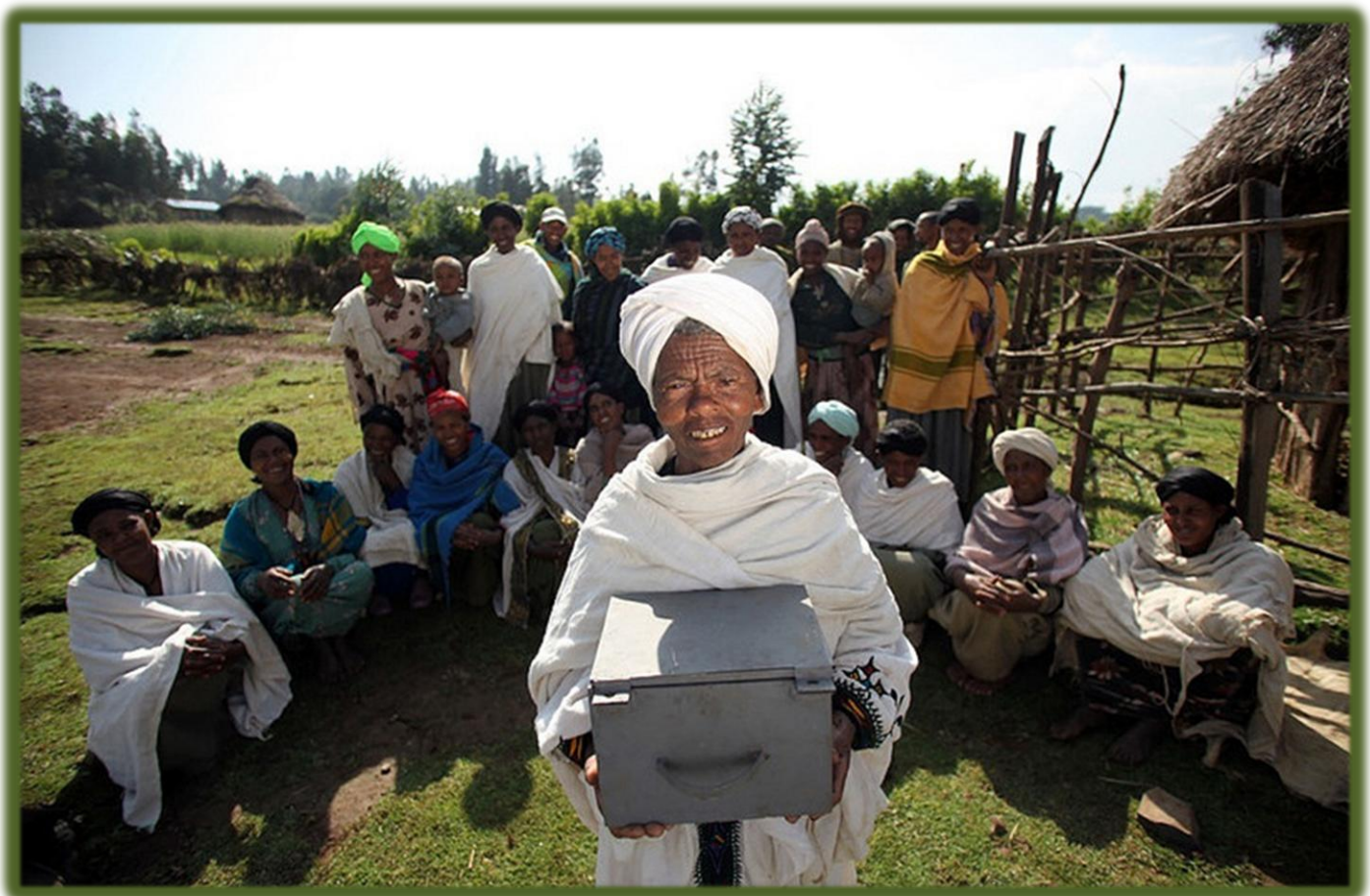
The treasurer of Beletech's (far left) community water committee in her village in Ethiopia displays the community savings box.